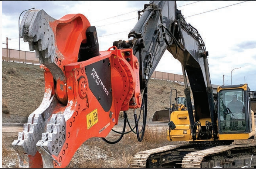
Unmatched Power to Weight