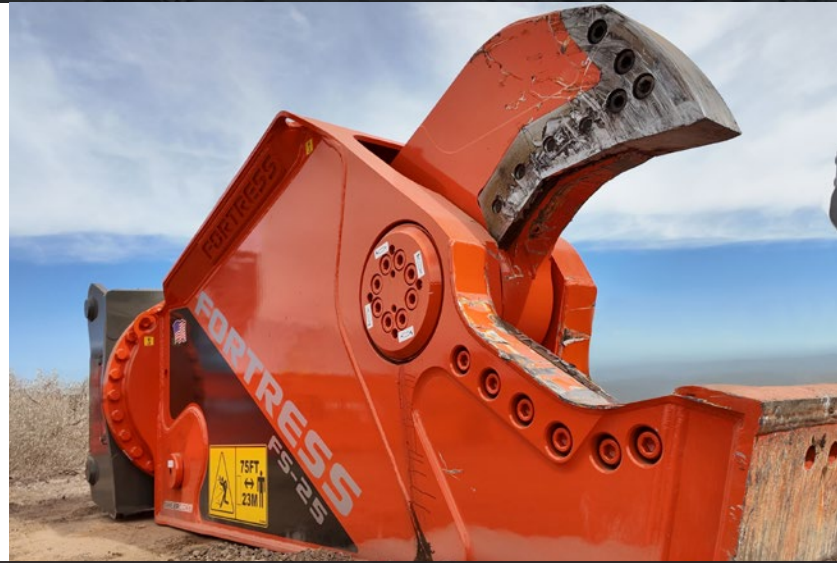
Unmatched Power to Weight