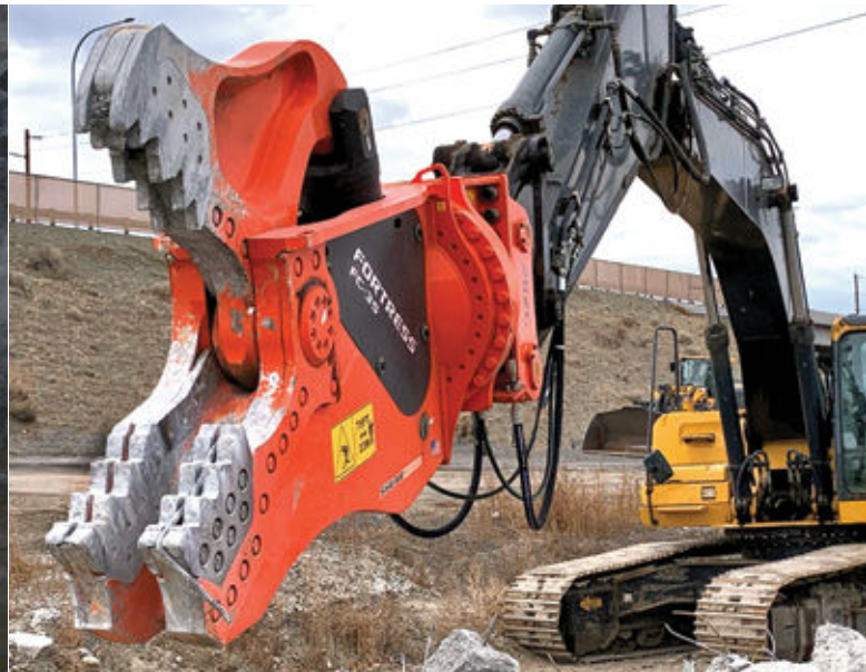
Unmatched Power to Weight