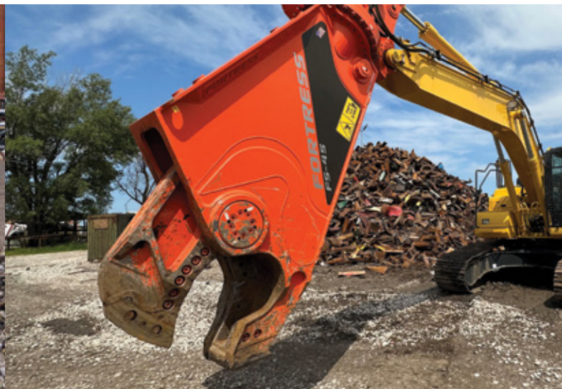
Unmatched Power to Weight

More power requires more strength and rigidity. Our unique manufacturing capabilities allow us to utilize 6" high-yield plate and use fewer overall components.